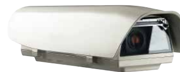
HOV + WIPER