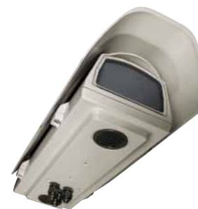
HOV + COOLING SYSTEM

→ VERSION FOR THERMAL IMAGING CAMERAS AVAILABLE: HTV □ 133