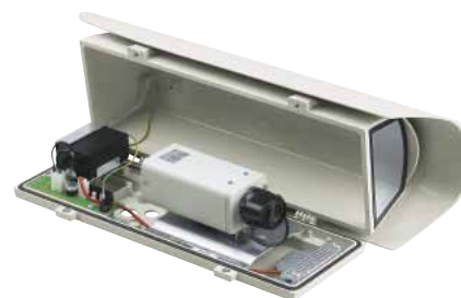
HOV + CAMERA